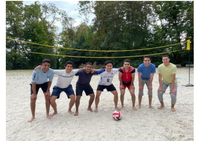
Volleyball at Champagne's park