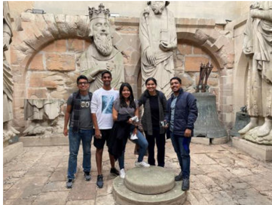
Roof top of the cathedral